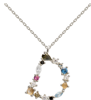
D SILVER RRP 59€