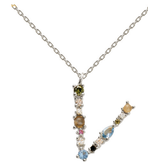
V SILVER RRP 59€