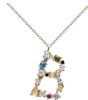
B SILVER RRP 59€