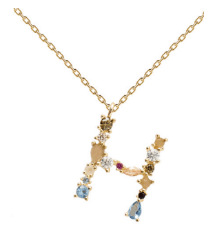
H GOLD RRP 59€

NECKLACE MATERIAL: 18k Gold plated 925 Sterling Silver