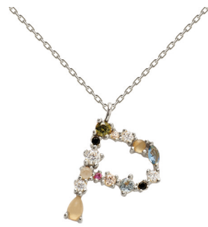
P GOLD RRP 59€