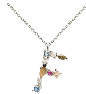
F SILVER RRP 59€