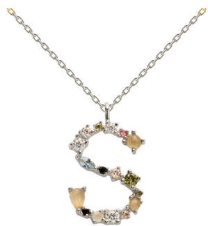
S SILVER RRP 59€