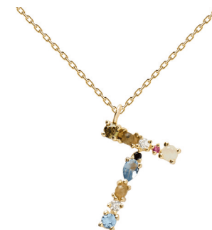
T GOLD RRP 59€

NECKLACE MATERIAL: 18k Gold plated 925 Sterling Silver