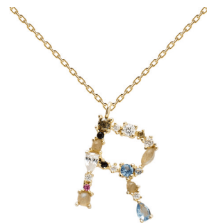
R GOLD RRP 59€

NECKLACE MATERIAL: 18k Gold plated 925 Sterling Silver