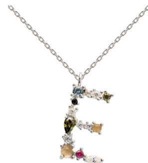
E SILVER RRP 59€