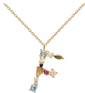
F GOLD RRP 59€

NECKLACE MATERIAL: 18k Gold plated 925 Sterling Silver