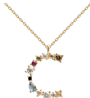
C GOLD RRP 59€

NECKLACE MATERIAL: 18k Gold plated 925 Sterling Silver