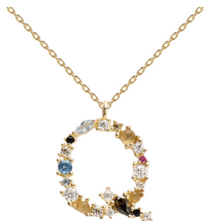
Q GOLD RRP 59€

NECKLACE MATERIAL: 18k Gold plated 925 Sterling Silver