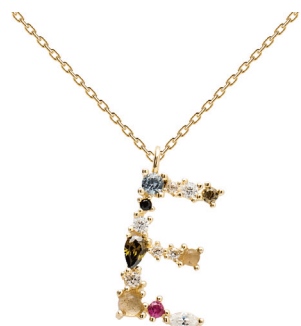
E GOLD RRP 59€

NECKLACE MATERIAL: 18k Gold plated 925 Sterling Silver