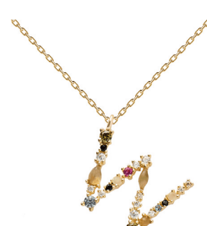
W GOLD RRP 59€

NECKLACE MATERIAL: 18k Gold plated 925 Sterling Silver