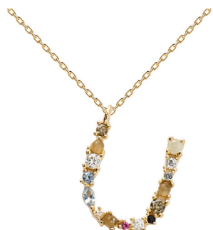
U GOLD RRP 59€

NECKLACE MATERIAL: 18k Gold plated 925 Sterling Silver