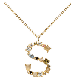
S GOLD RRP 59€

NECKLACE MATERIAL: 18k Gold plated 925 Sterling Silver