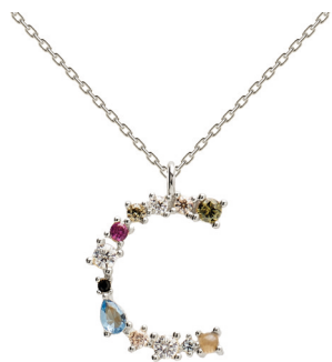
C SILVER RRP 59€