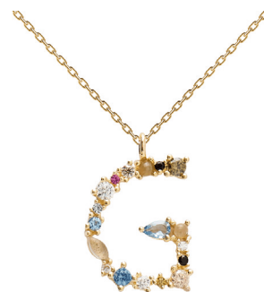
G GOLD RRP 59€

NECKLACE MATERIAL: 18k Gold plated 925 Sterling Silver