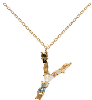
Y GOLD RRP 59€

NECKLACE MATERIAL: 18k Gold plated 925 Sterling Silver