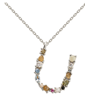
U SILVER RRP 59€