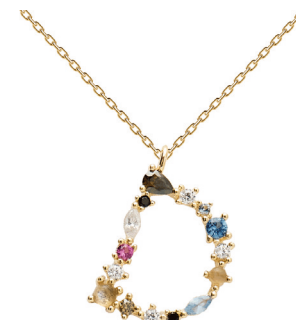
D GOLD RRP 59€

NECKLACE MATERIAL: 18k Gold plated 925 Sterling Silver