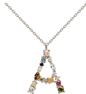
A SILVER RRP 59€