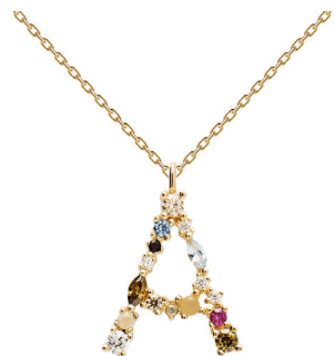
A GOLD RRP 59€

NECKLACE MATERIAL: 18k Gold plated 925 Sterling Silver