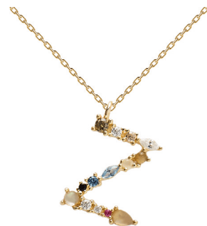
V GOLD RRP 59€

NECKLACE MATERIAL: 18k Gold plated 925 Sterling Silver