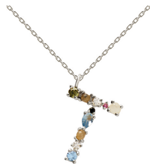
T SILVER RRP 59€