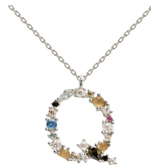
Q GOLD RRP 59€