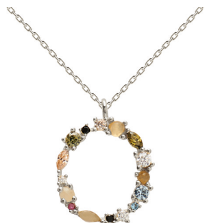
O GOLD RRP 59€