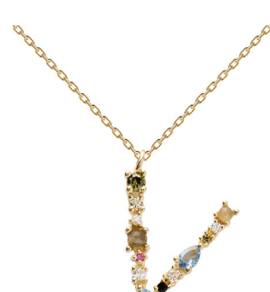
V GOLD RRP 59€

NECKLACE MATERIAL: 18k Gold plated 925 Sterling Silver