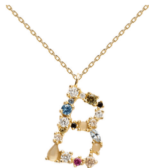
B GOLD RRP 59€

NECKLACE MATERIAL: 18k Gold plated 925 Sterling Silver