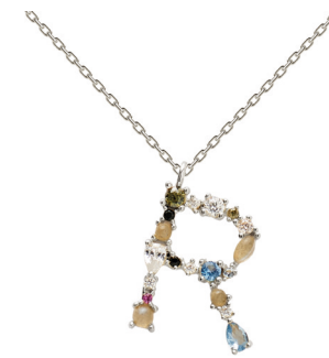
R GOLD RRP 59€