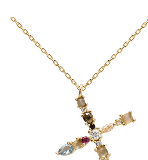
X GOLD RRP 59€

NECKLACE MATERIAL: 18k Gold plated 925 Sterling Silver