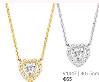
V1447 | 40+5cm €65