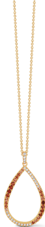
V1444 | 40+5cm €109