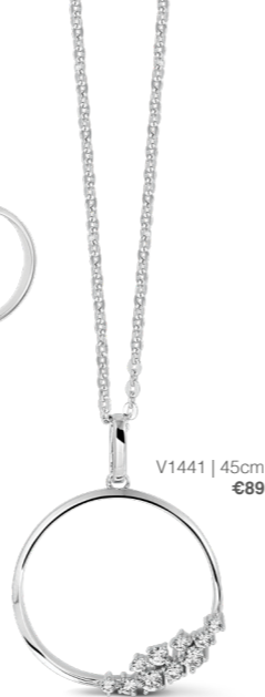
V1441 | 45cm €89