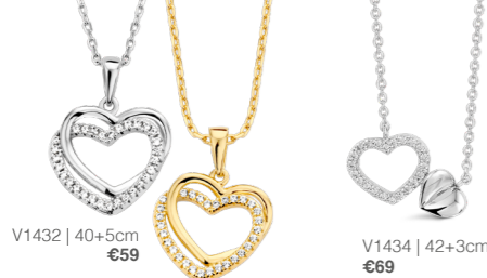
V1432 | 40+5cm €59